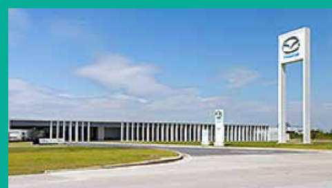
Mazda Powertrain Manufacturing (Thailand)

HIROSHIMA, Japan —Mazda Motor Corporation has announced that it held an opening ceremony today at Mazda Powertrain Manufacturing (Thailand) Co., Ltd. (MPMT), the company's new powertrain plant located in Eastern Seaboard Industrial Estate (Rayong), Thailand.